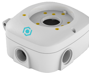
B6BASE1 JUNCTION BOX