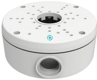
EB3BASE4 JUNCTION BOX