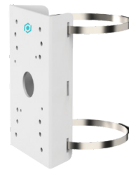
PMB6 POLE MOUNT BRACKET

2024 Global Surveillance Distribution, G.S.D Group and G.S.D are registered trademarks of Global Surveillance Distribution Group, Inc. in Canada and / or other countries. We reserve the right to change the design and specifications of the product Without notice and without incurring any obligation.