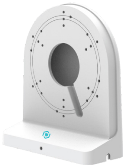
WMB5 WALLMOUNT BRACKET