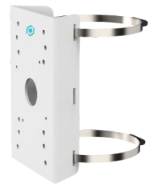
PMB6 POLE MOUNT BRACKET